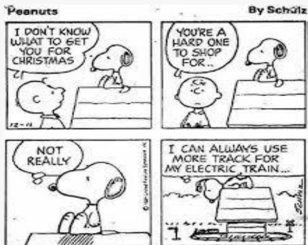
Peanuts comic from Google Images.

Consider an NMRA membership or an item from the NMRA Store for your model railroader next year.